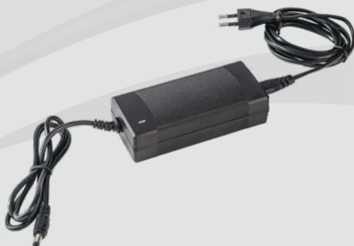
DEDICATED POWER ADAPTER