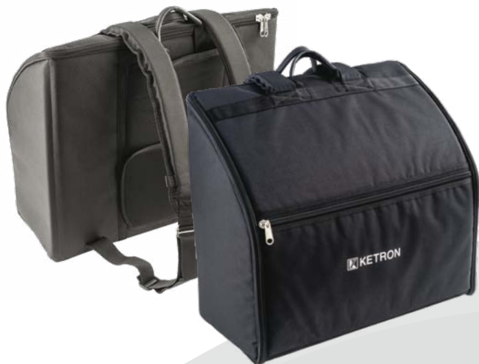
LUXURY PADDED GIG BAG