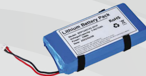
HIGH CAPACITY LITHIUM BATTERY PACK