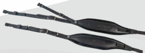
ERGONOMIC SHOULDER STRAPS